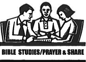
BIBLE STUDIES/PRAYER & SHARE