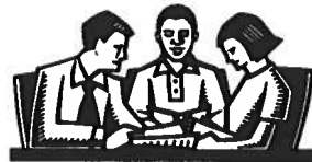
BIBLE STUDIES/PRAYER & SHARE